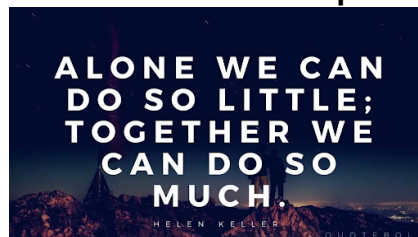
Positive word power