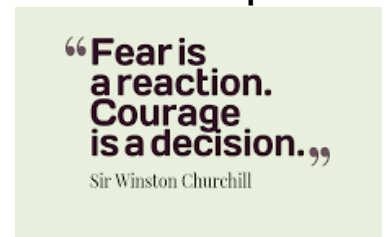
Positive heart power