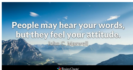
Positive people power

A huge thank you for the generosity of parents and teachers who contributed to this awesome time together. Watch out for further pictures and news about camp.