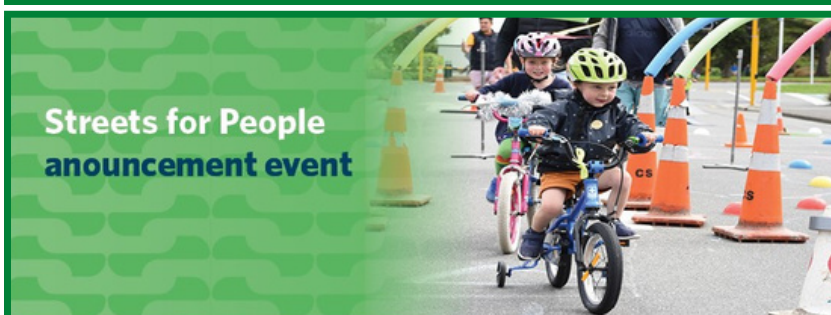
Streets for People announcement event

On Tuesday 6 September (10.30am-11.30am), Hon Michael Wood, Minister of Transport will be visiting our school and he will announce the successful group of councils who will be implementing street change projects across Aotearoa New Zealand, as part of the Waka Kotahi Streets for People programme 2021-24.